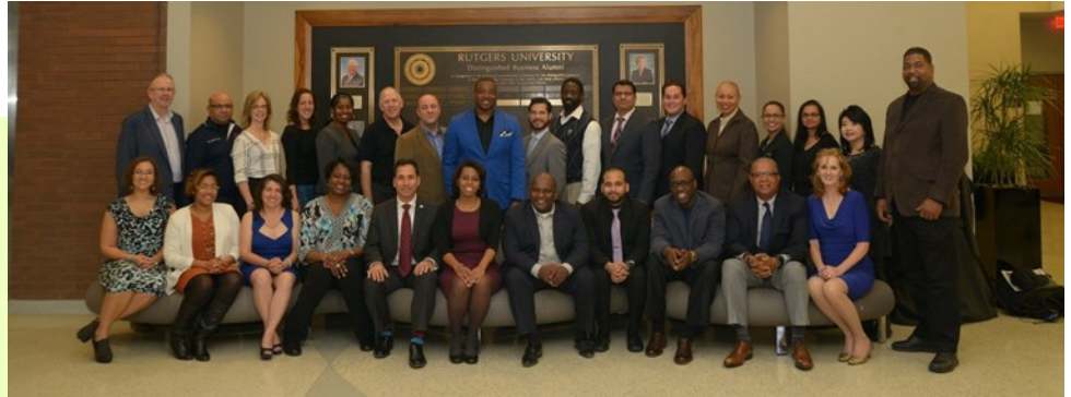
EPI Fellowship 2016 Graduating Class

EPI is a comprehensive award winning capacity building training program focused on helping first generation entrepreneurs in New Jersey. Selected participants receive intensive training, business and financial counseling, mentoring and networking opportunities to help grow their business. EPI is entering its 8 th year and is a partnership with non-profit, for-profit, corporate, and community-based organizations.