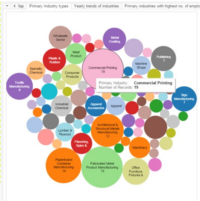
Sample data snapshot of Primary Industry Types in the city of Newark.