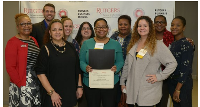
Etsy Craft Entrepreneurship Program

Newark Business Hub ecosystem in Newark, NJ CUEED recently by providing educational resources, inspiration and collaboration opportunities that will help creative individuals start and expand profitable businesses, create wealth and jobs and change the narrative the entrepreneurial of Newark.