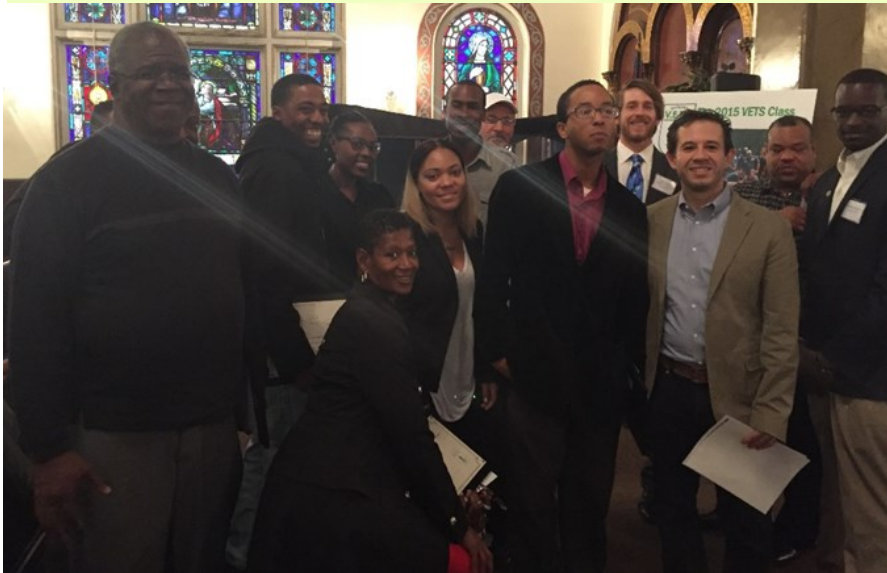
Graduation Vets Program Class 2015

The success of this program has provided opportunities to initiate conversation to develop similar initiatives at other localities through New Jersey. At its core, this program leverages the strong commitment and leadership training that our Veterans have and put it to the service of our communities as we seek to move towards a more sustainable society.